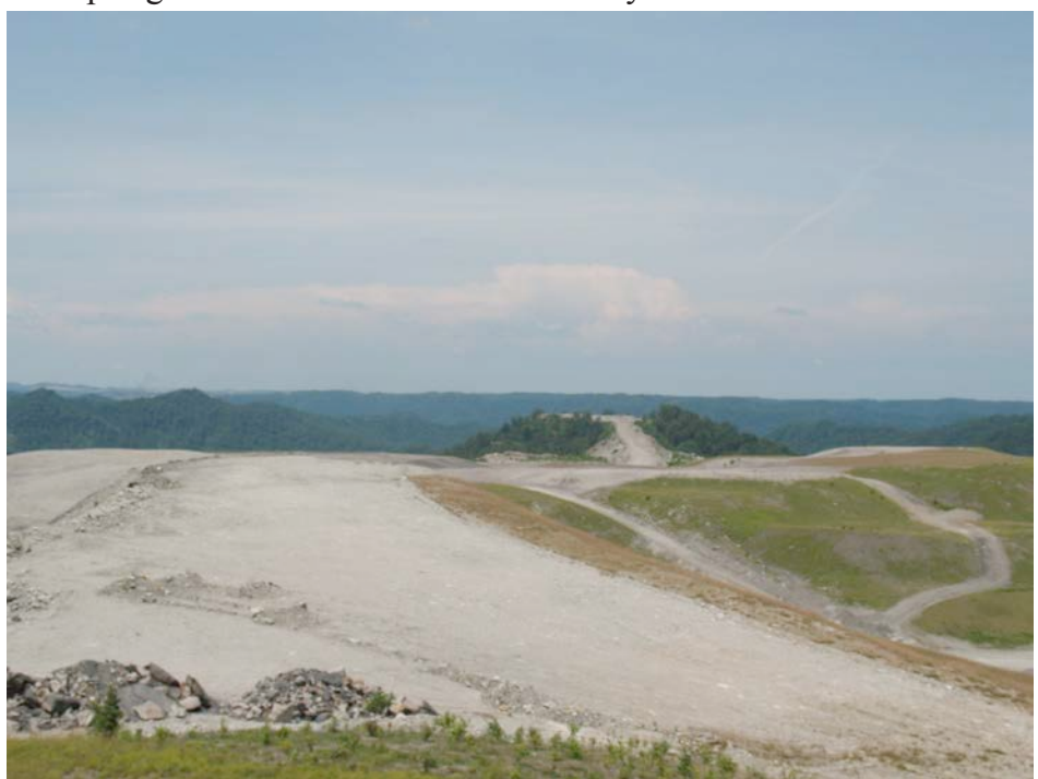
A mountaintop coal mine in West Virginia.

You've been surprised at the quite different reactions you've had from people in the Shady Creek community when you've brought up the issue of the school's water. Some people think it would be better not to give the problem a lot of public