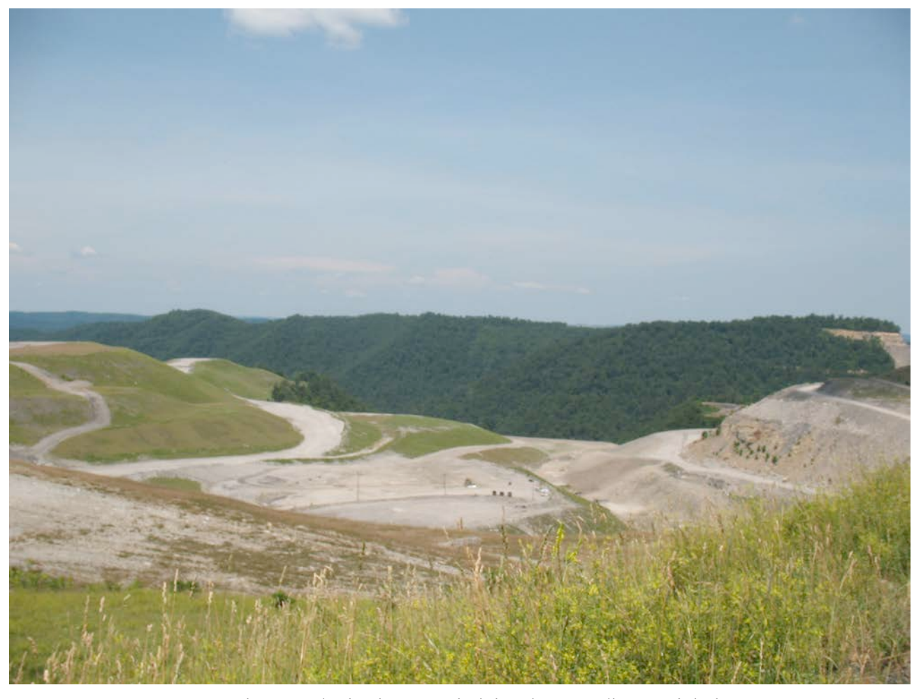
A mountaintop coal mine in West Virginia.

I would like you to begin by stepping into the shoes of the character you will be in the simulation. First, imagine it is morning and your alarm clock has just gone off. If you can, begin this exercise by lying down with your eyes closed to get the feel of waking up and beginning a day in someone else's shoes. What does it feel like to go about your day in this role? Answering the questions below will help you to step into the role and imagine the context and daily life of the person you will be in the simulation. For some people it is easier to close their eyes and try to picture the context of the person they will be in the simulation, taking time after having gone through all of these questions to begin their writing.