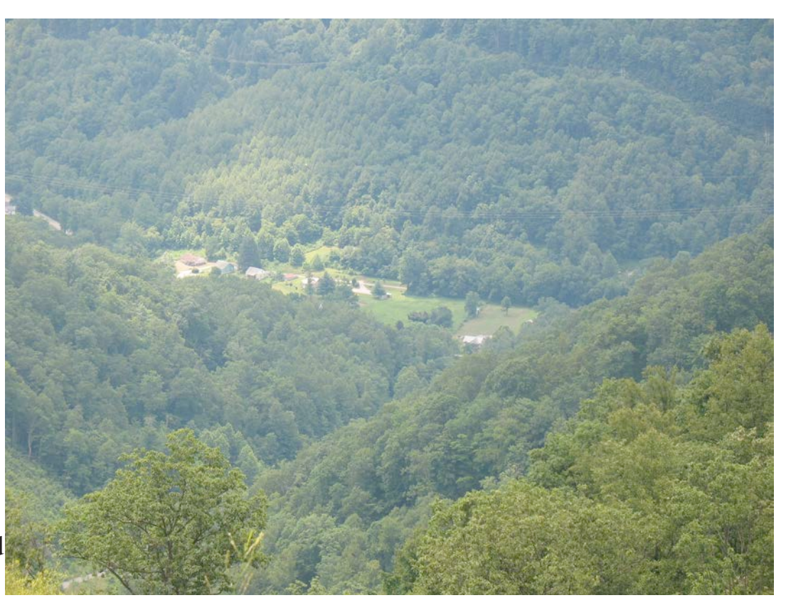
Mountains and Valley Community.

happen during your day. Do you go to work? If so what is that like? Who do you meet? What are their names? If something happens that really bothers you what is it? Who gets under your skin? Why? Also, who are the people that are sources of support? Who are the people that give you strength? For each of the people you think of or meet, make sure you give them a name.